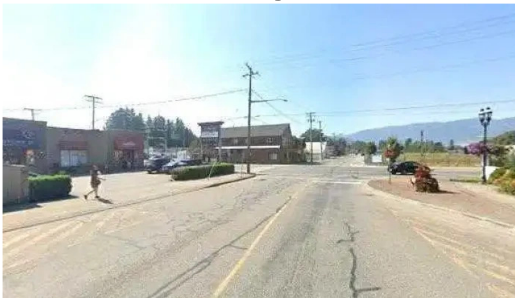
Davidiuk len tax serviced street view 360