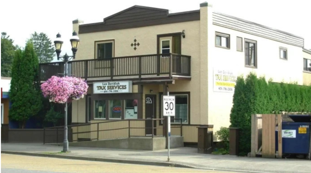
Davidiuk len tax serviced all