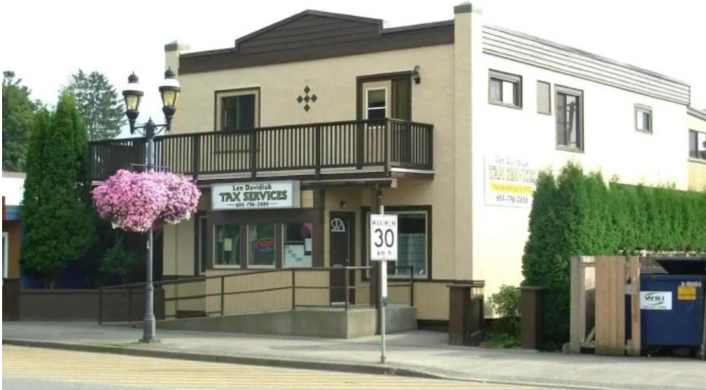
Daviduk len tax serviced agassiz