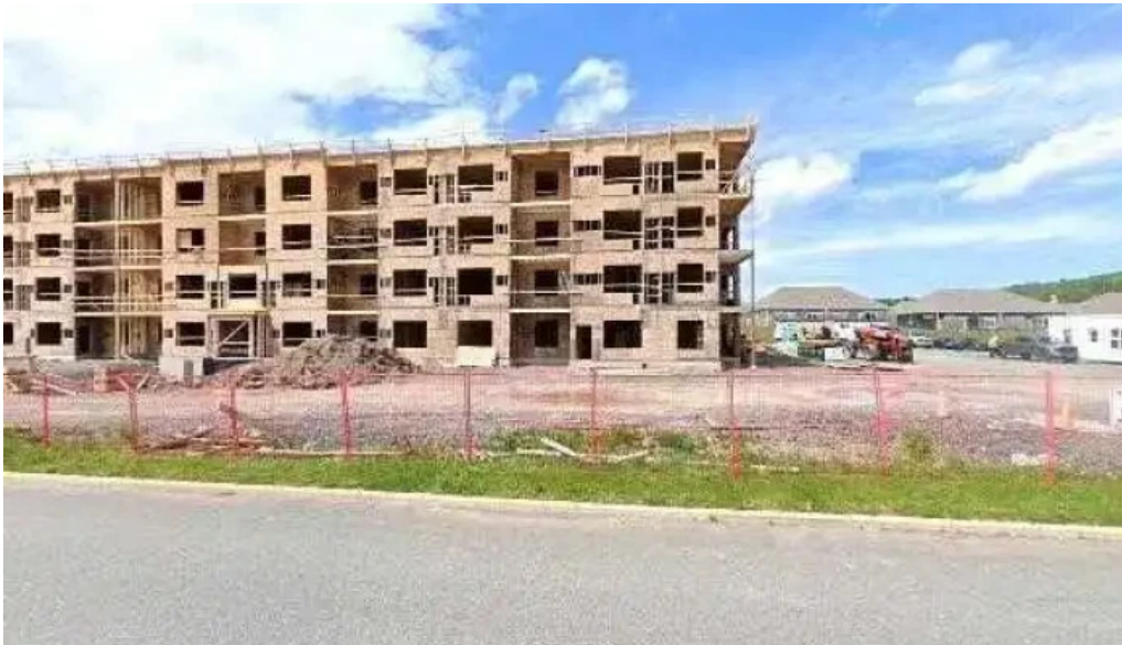
The maples supportive living street view 360deg