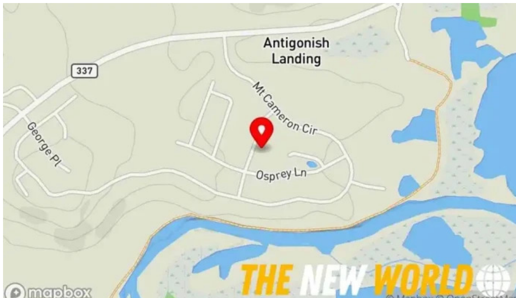
The maples supportive living map