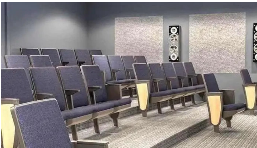
The maples supportive living amenities