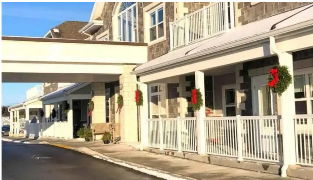
The maples supportive living antigonish