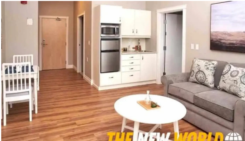
The maples supportive living by owner