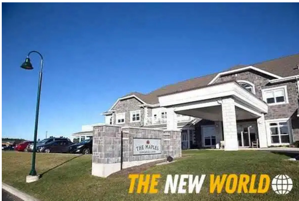
The maples supportive living exterior