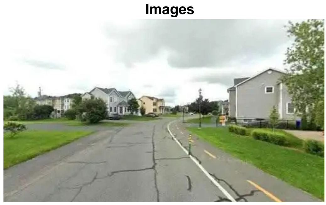
Residence rouville dange gardien street view 360deg

If you wish to change any data that you consider is incorrect about this web, we kindly request send a message so we can we will adjust it quickly. Thanks beforehand we appreciate it.