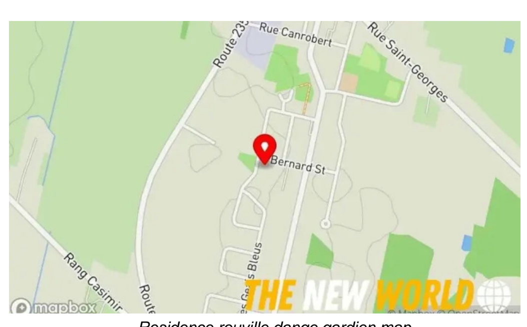
Residence rouville dange gardien map