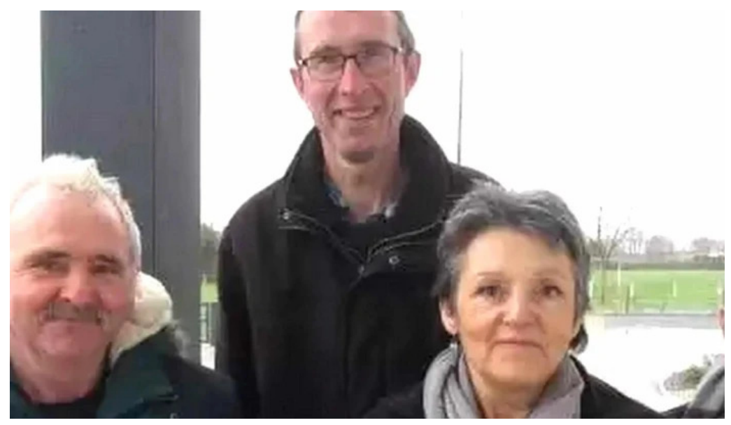
Residence rouville dange gardien retirement home