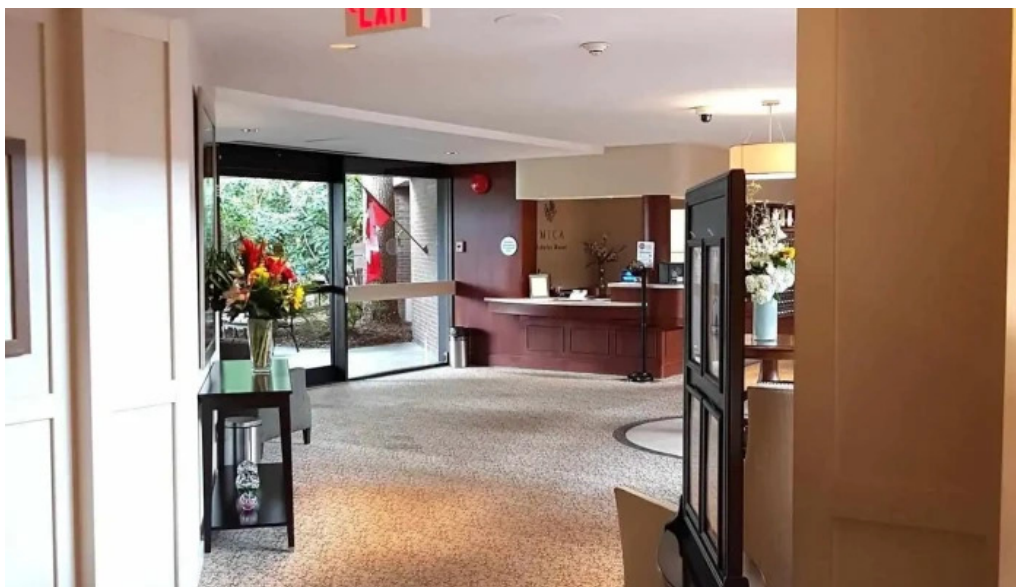
Amica arbutus manor from visitors