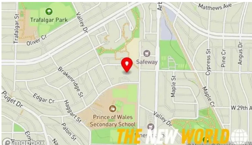
Amica arbutus manor map