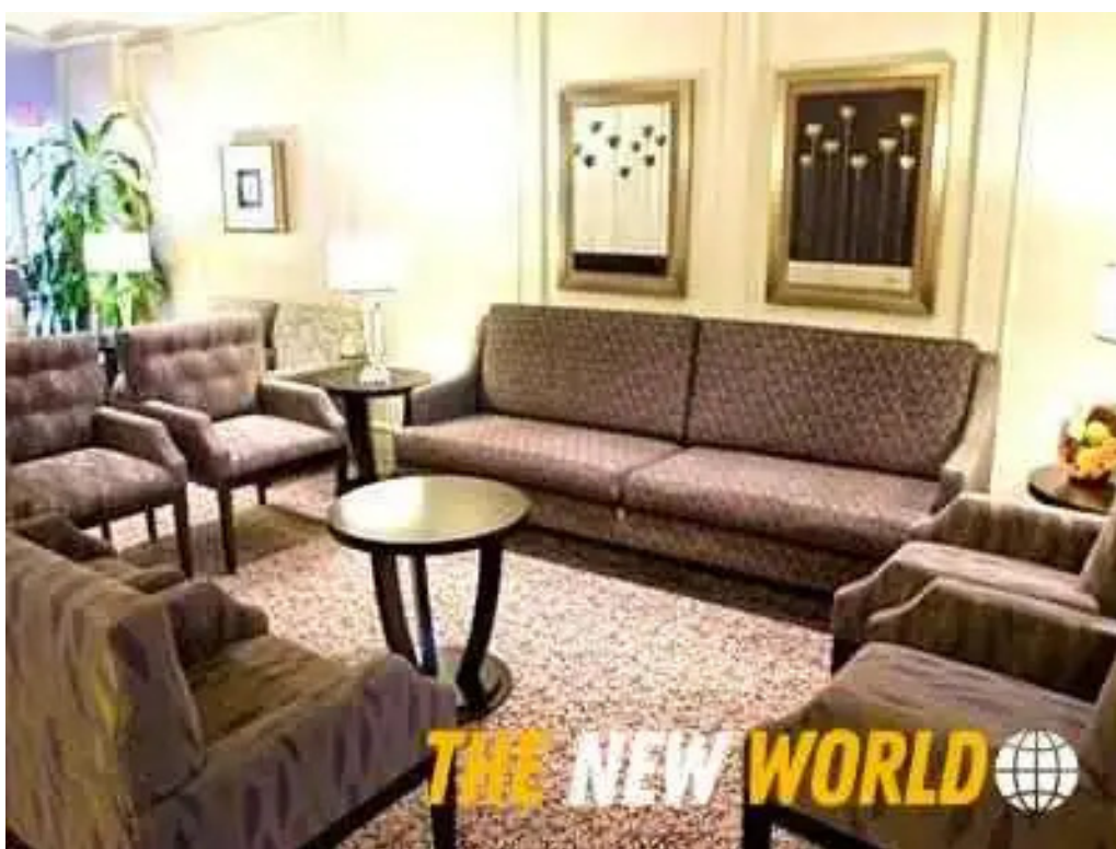
Amica arbutus manor rooms