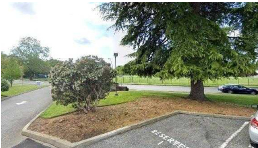
Amica arbutus manor street view 360deg