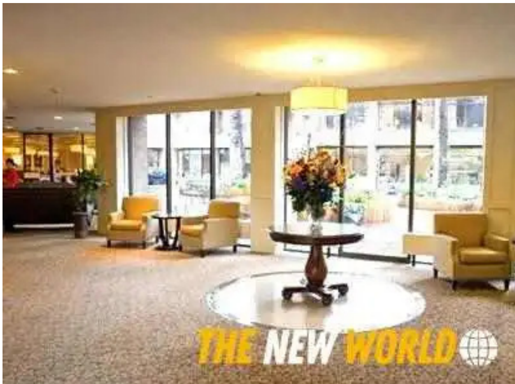
Amica arbutus manor by owner