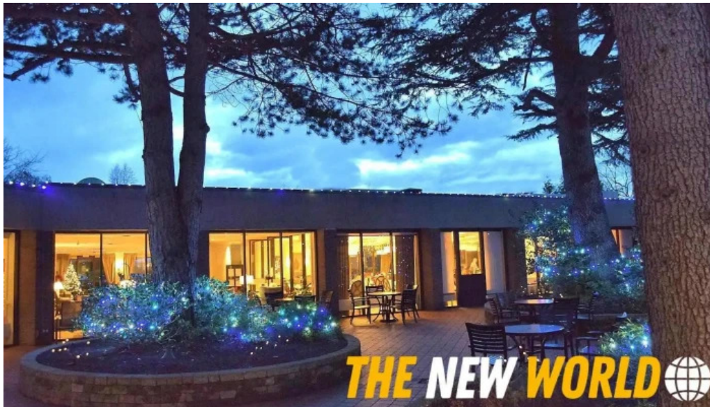
Amica arbutus manor exterior