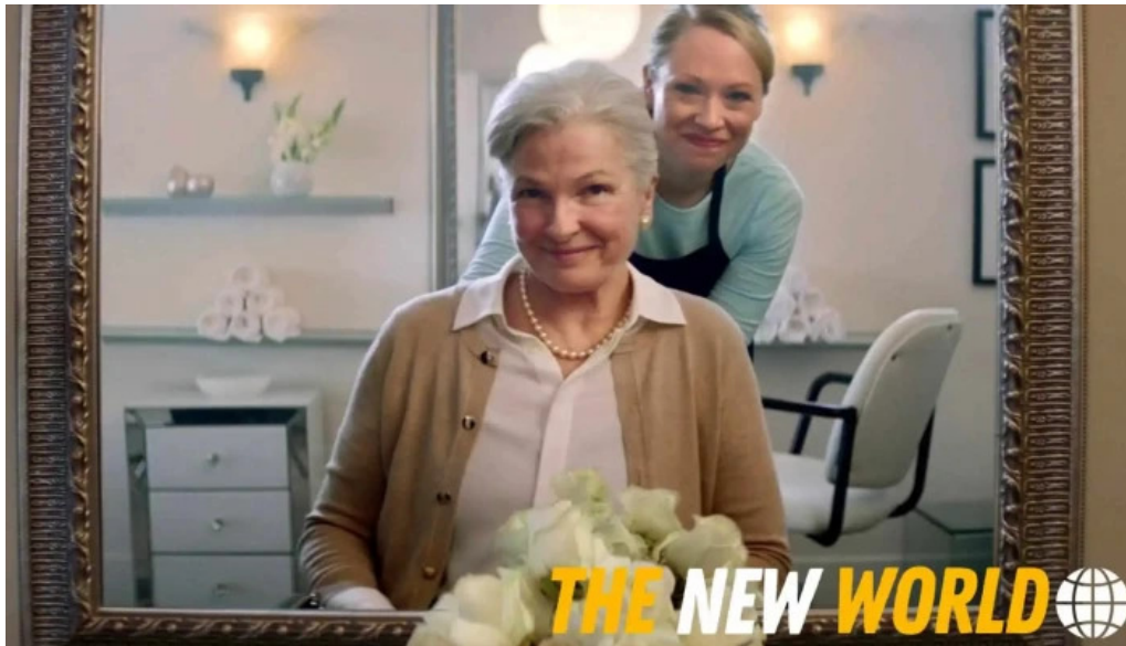
Amica arbutus manor videos