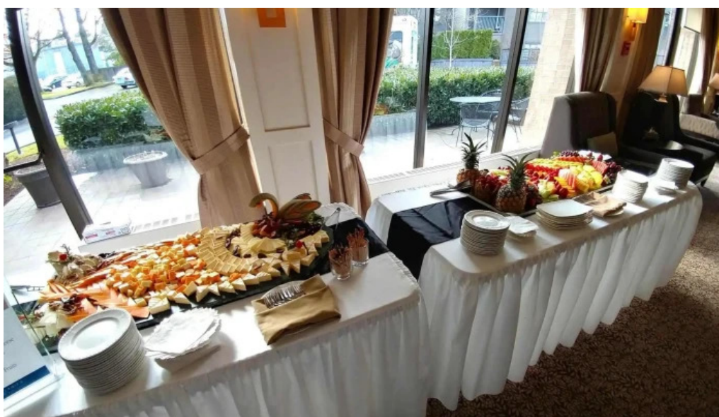
Amica arbutus manor food drink