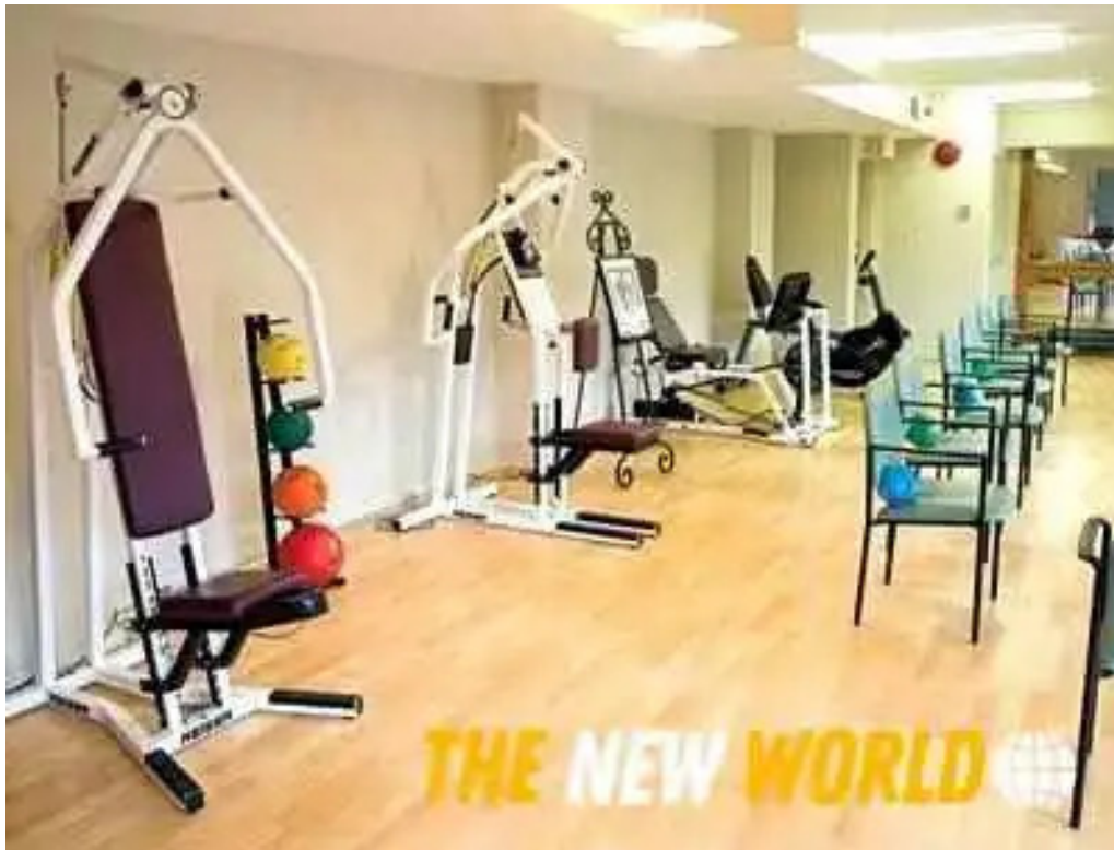
Amica arbutus manor amenities