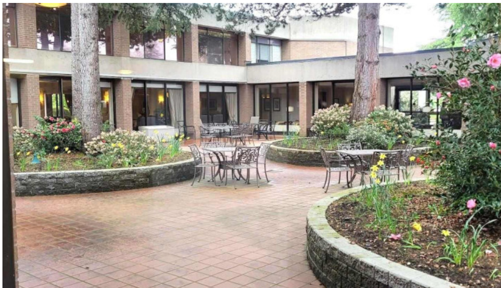
Amica arbutus manor vancouver