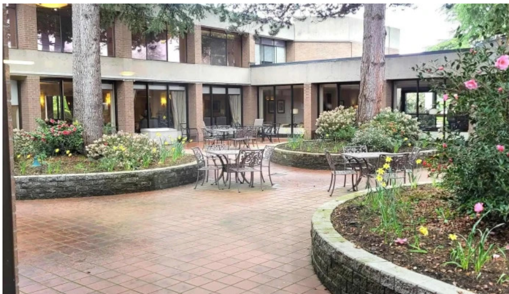
Amica arbutus manor all