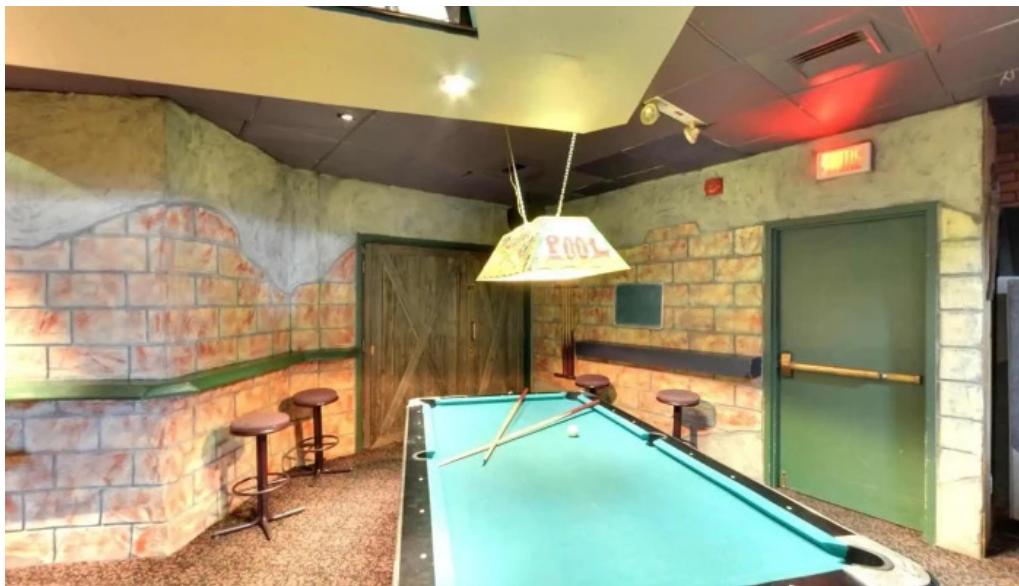
Amosphere resort amenities