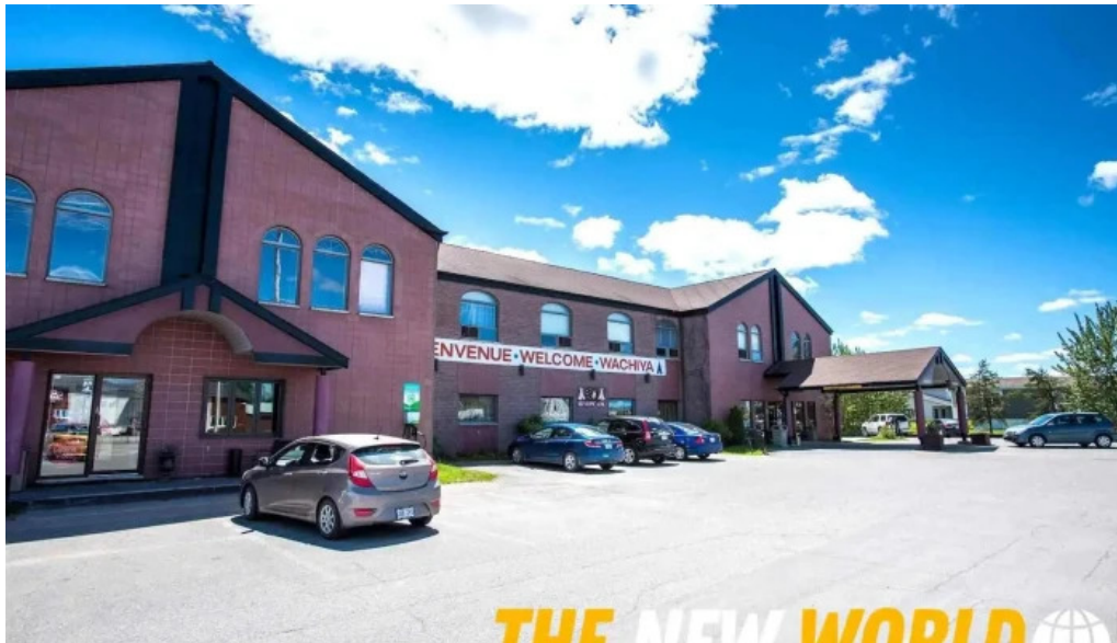
Amosphere resort amos