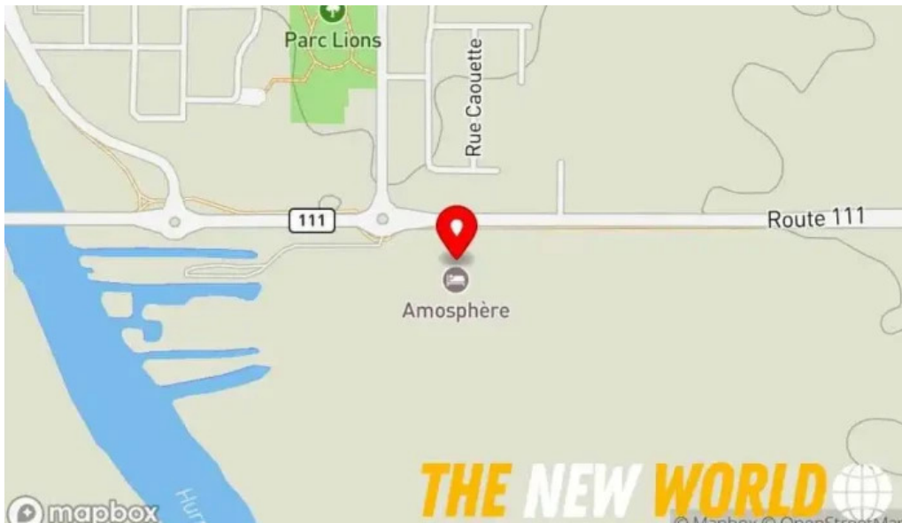
Amosphere resort map