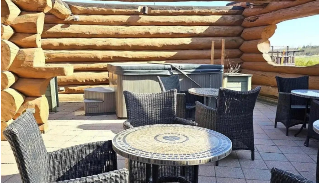
Amosphere resort from visitors