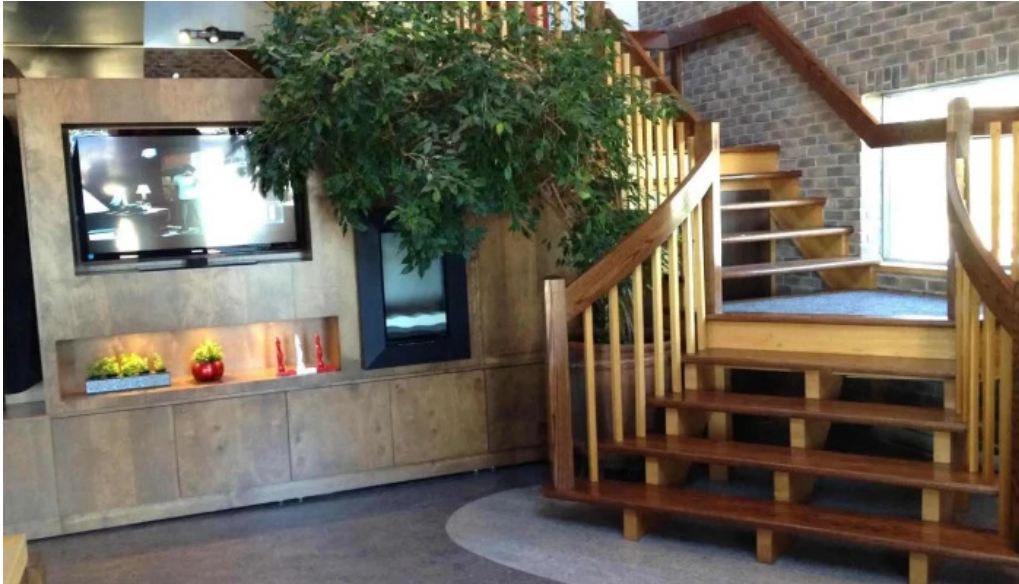
Amosphere resort exterior