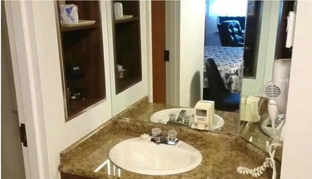
Amosphere resort videos