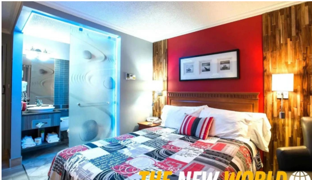
Amosphere resort rooms