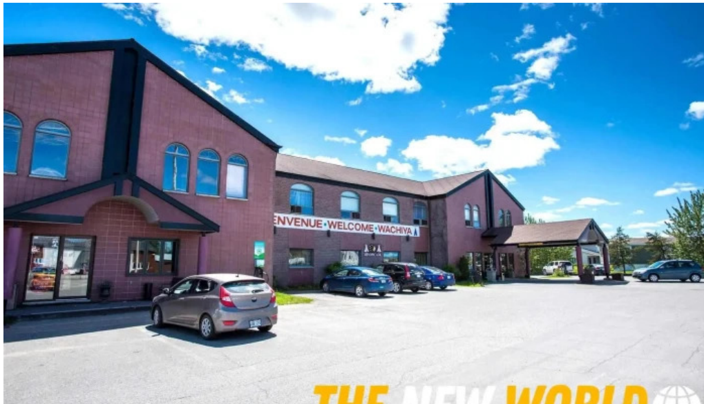
Amosphere resort all