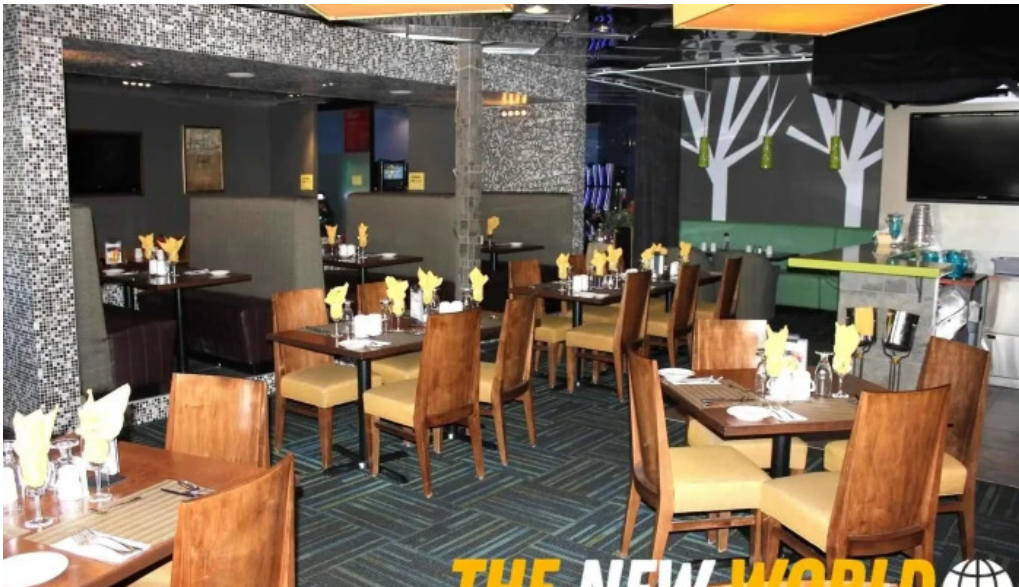
Amosphere resort by owner