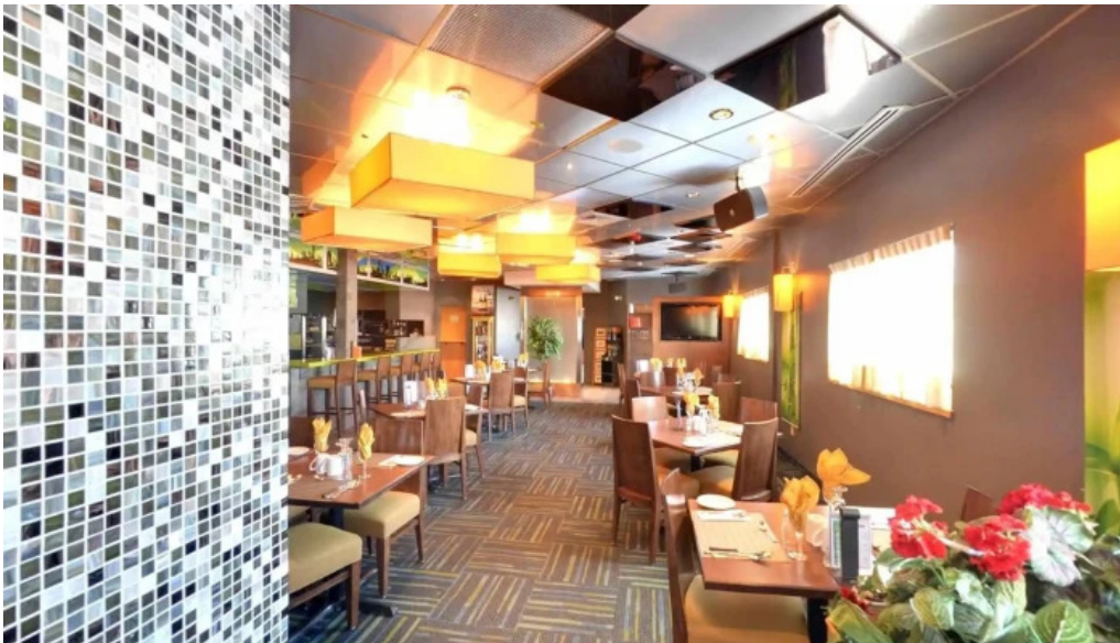
Amosphere resort street view 360deg