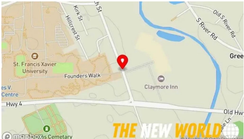
Von antigonish map