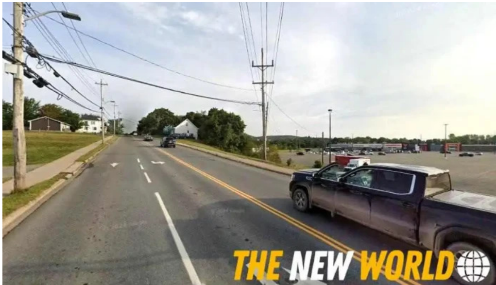
Von antigonish antigonish