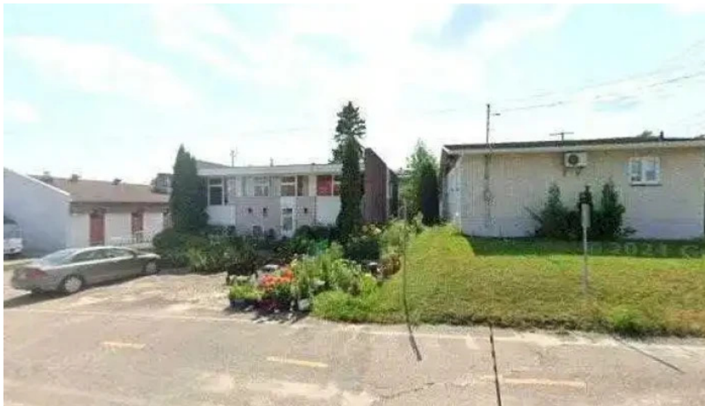
Agence de gestion integree des ressources agir street view 360deg