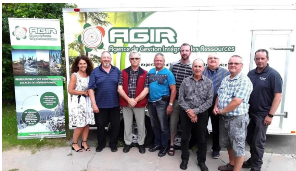
Agence de gestion intégrée des ressources agir all