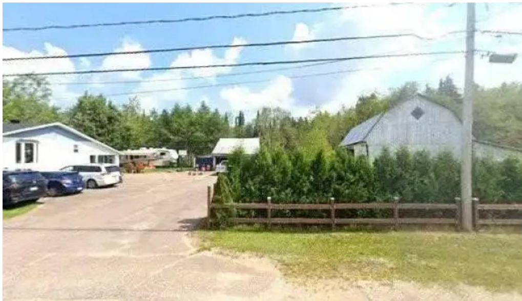
Extincteurs 2c street view 360deg