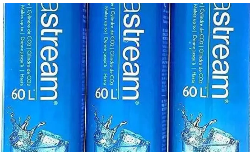
Extincteurs 2c by owner