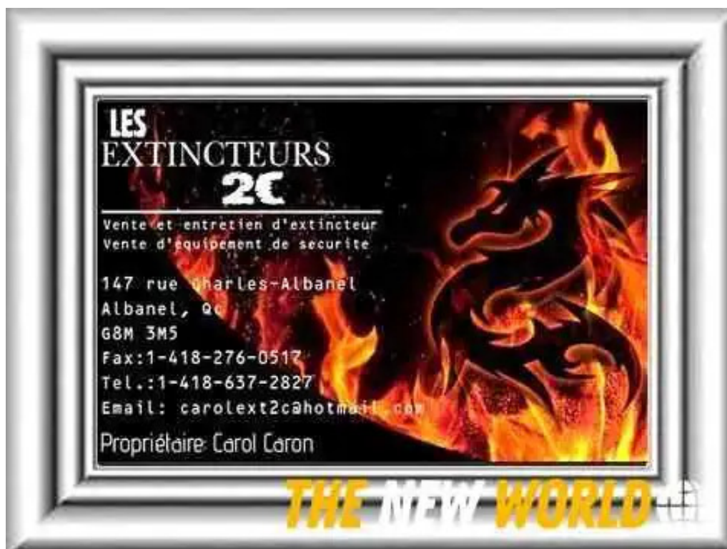
Extincteurs 2c albanel