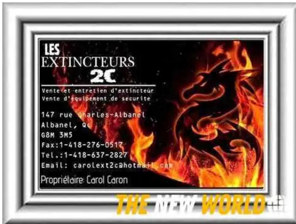
Extincteurs 2c all