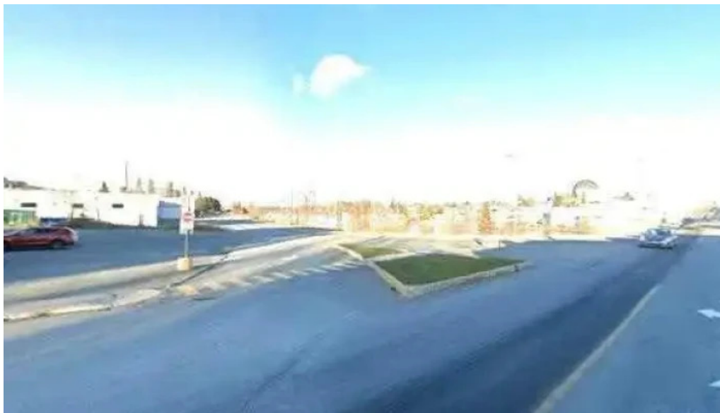
Chambre de commerce et d'industrie du centre abitibi street view 360deg