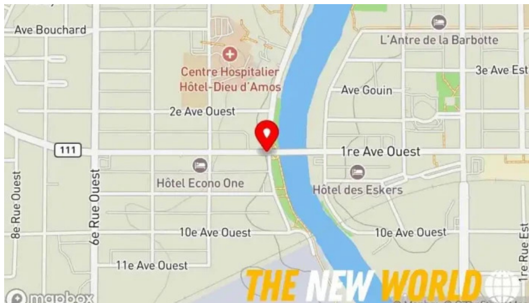
Chambre de commerce et d'industrie du centre abitibi map