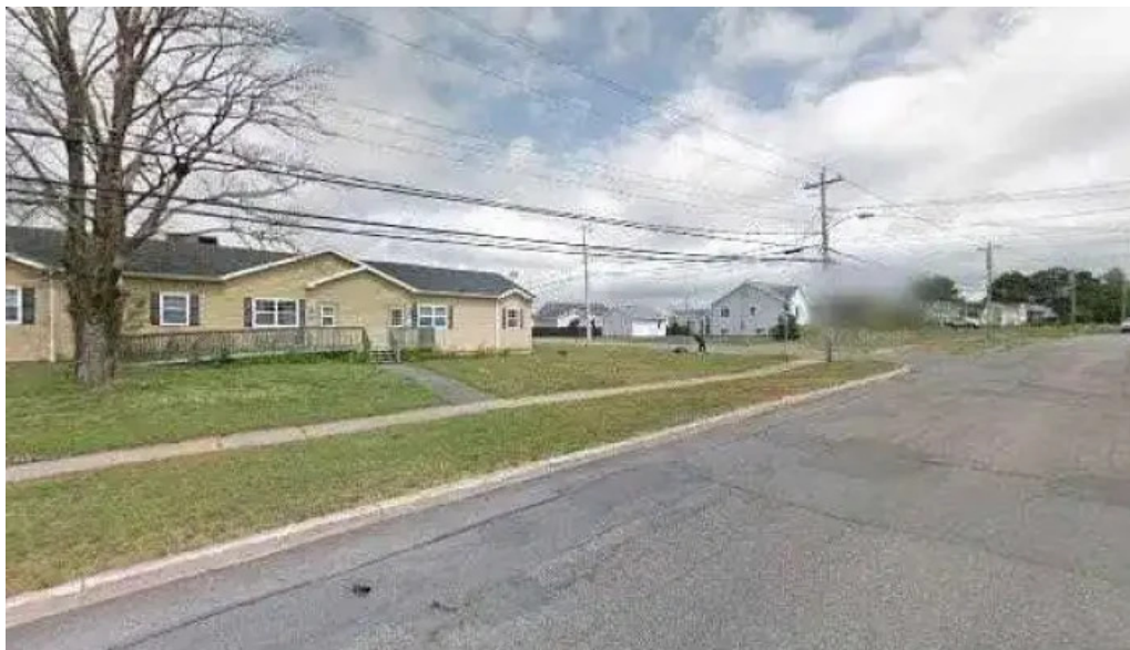
Amherst and district residential services society street view 360deg