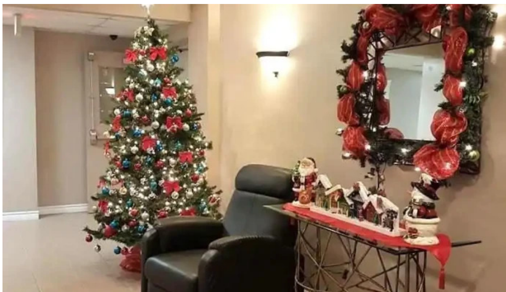
Amherst and district residential services society amherst