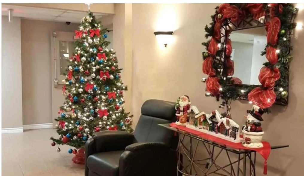
Amherst and district residential services society all