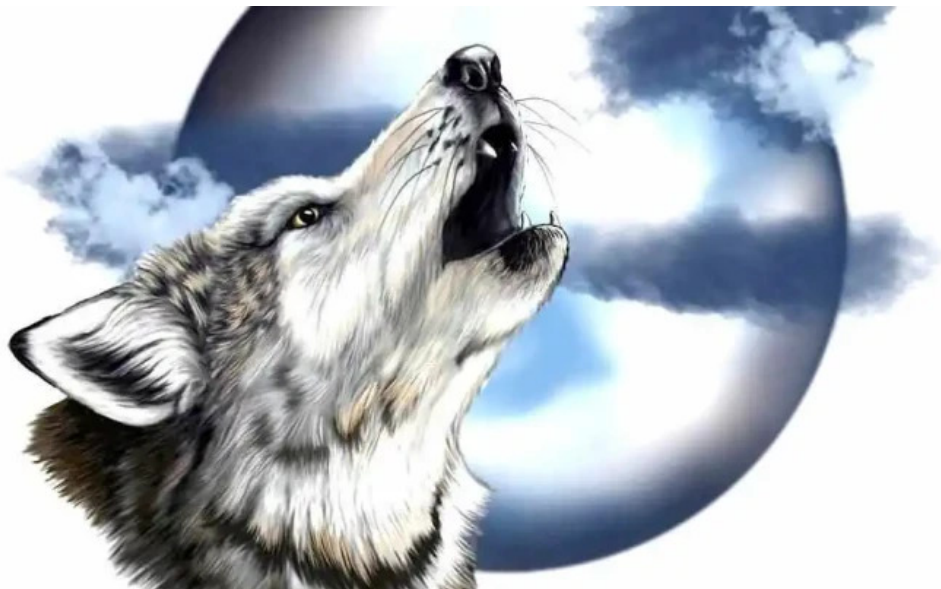
Country tax accounting by owner