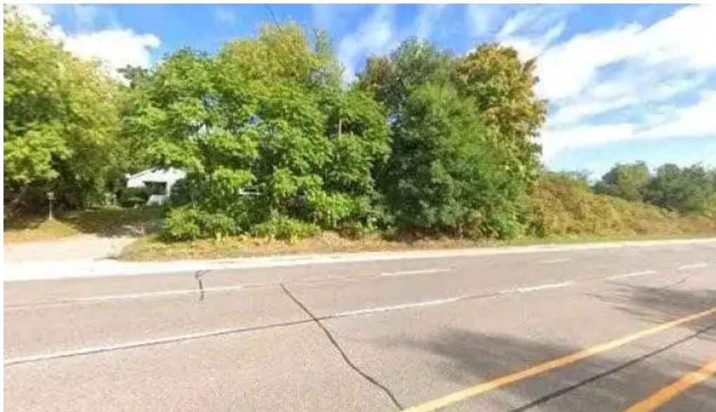
Country tax accounting street view 360deg